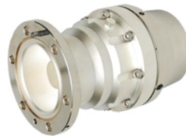
Connector 3-1/8" EIA