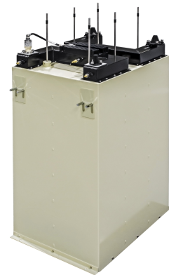
CA3P200IB16 Integrated FM Combiner Module