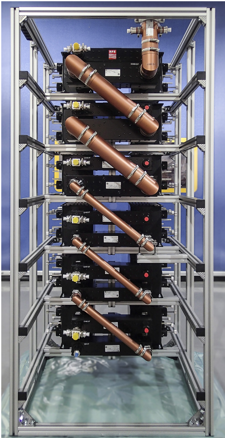
Six module combiner