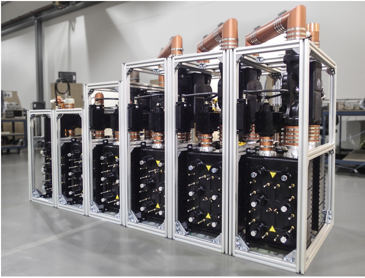
Six channel combiner