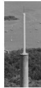
CBS and 2CBS Antenna Series showing CBS7