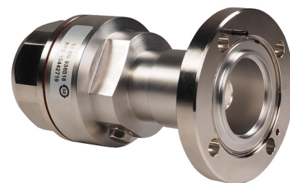
158EIA Connector for HCA158 Cable