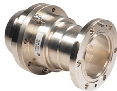
318EIA Connector for HCA400 Cable