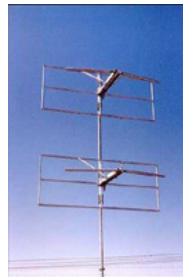
606L Antenna Series showing 606L panel