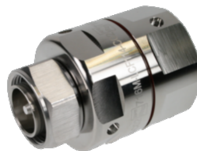
OMNI FIT™ Standard Connectors