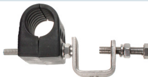
picture shows MBHS78-1-F for illustration purpose