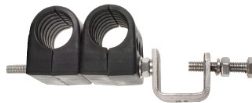
picture shows MBHS78-2-F for illustration purpose