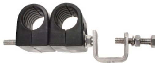
picture shows MBHS78-2-F for illustration purpose